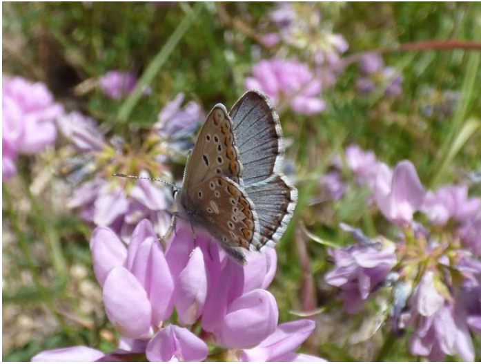
Pic.20. Blue Argus ( Aricia anteros )