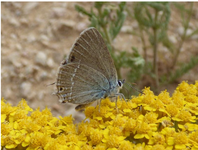
Pic.16. Gerhard's Black Hairstreaks ( Satyrium abdominalis )