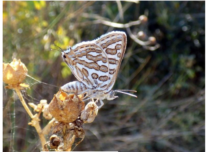
Pic.3. Lebanese Silver-line ( Cigaritis acamas )