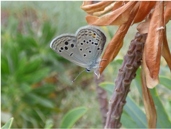
Pic.22. Odd-spot Blue ( Turanana endymion )