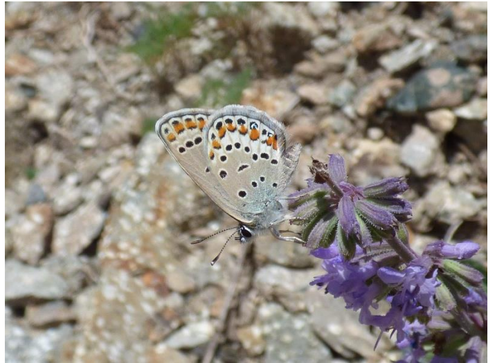
Pic.27. Eastern Brown Argus ( Plebejus eurypilus )