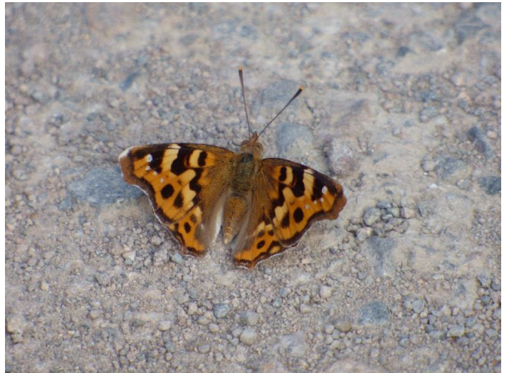
Pic.29. Ionian Emperor ( Thaleropsis ionia )