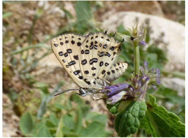
Pic.21. Levantine Silver-line ( Cigaritis cilissa )