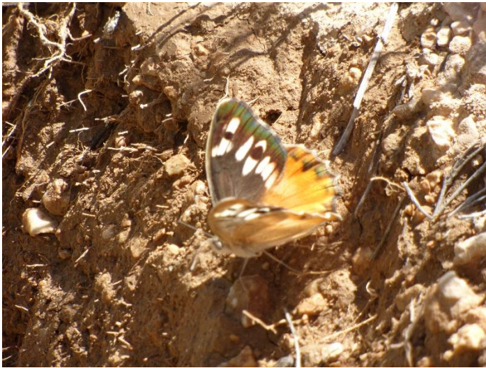
Pic.14. Orange Hermit ( Chazara bischoffii )