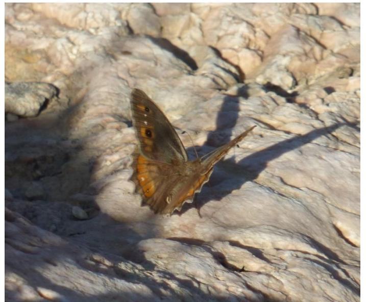
Pic.13. Klug's Tawny Rockbrown ( Pseudochazara pelopea )