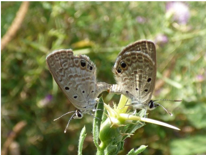
Pic.4. Small Desert Blue ( Lachides galba )