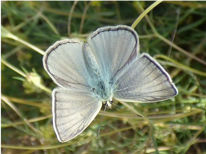
Pic.10. Turkish Furry Blue ( Polyommatus menalcas )