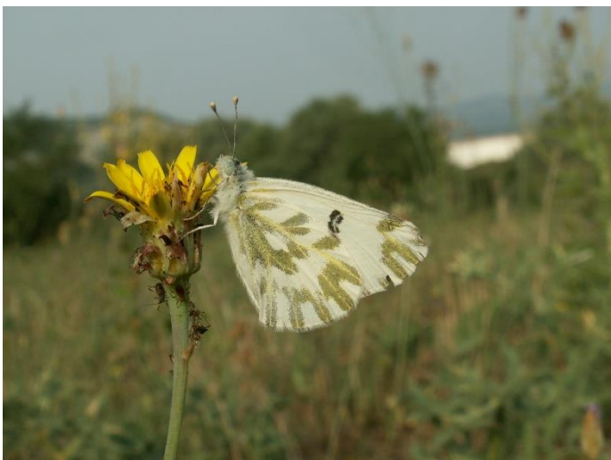
Pic.6. Small Bath White ( Pontia chloridice )