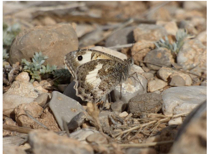
Pic.9. White-banded Grayling ( Pseudochazara anthelea )