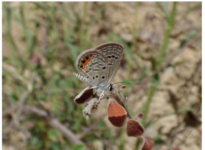
Pic.31. Grass Jewel ( Chilades trochylus )