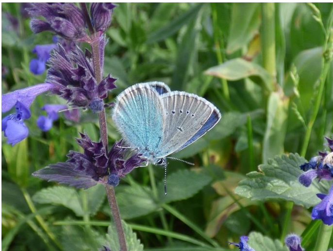
Pic.24. Pontic Blue ( Polyommatus coelestinus )