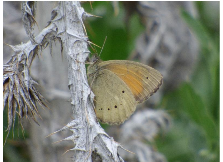
Pic.23. Lesser Lattice Brown ( Esperarge climene )