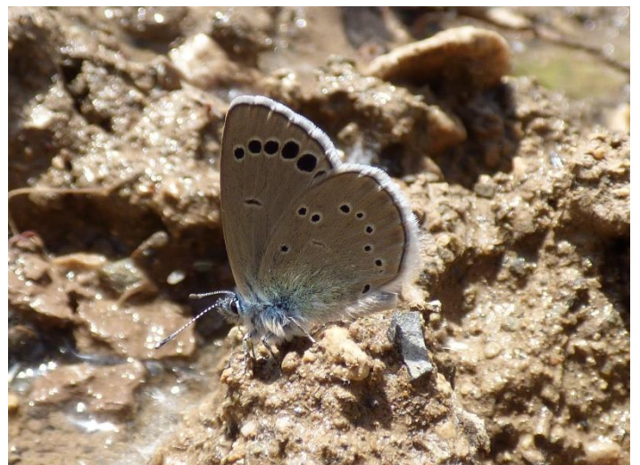
Pic.7. Anatolian Green-underside Blue ( Glaucopsyche astraea )