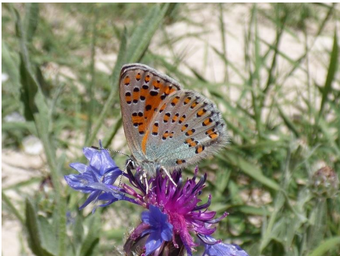
Pic.12. Nogel's Hairstreak ( Tomares nogelii )