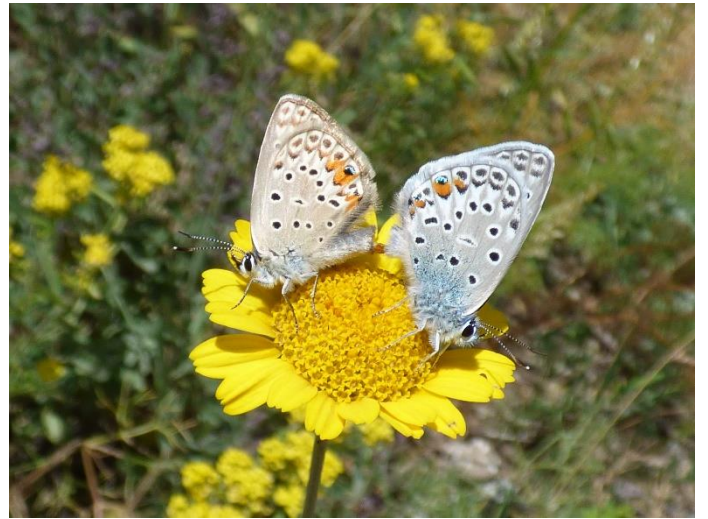
Pic.15. Loew's Blue ( Plebejus loewii )