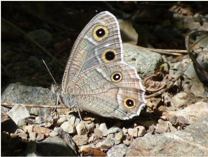
Pic.28. White-bordered Grayling ( Hipparchia parisatis )