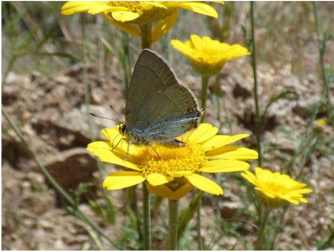
Pic.26. Rebel's Hairstreak ( Satyrium myrtale )