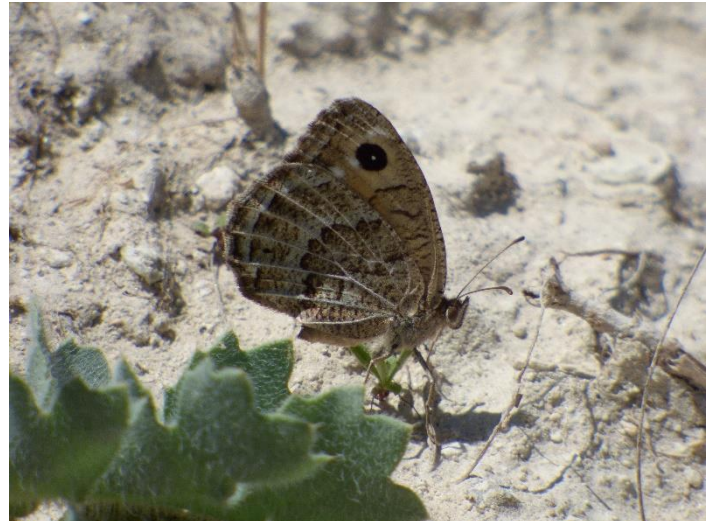
Pic.11. Amasian Satyr ( Satyrus amasinus )