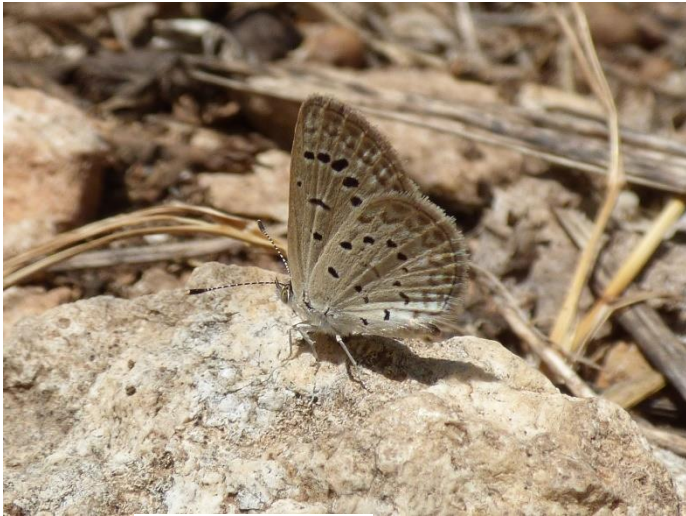
Pic.2. Indian Grass Blue ( Zizeeria karsandra )