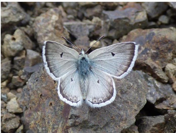
Pic.18. Bosnian Blue ( Plebejus dardanus )