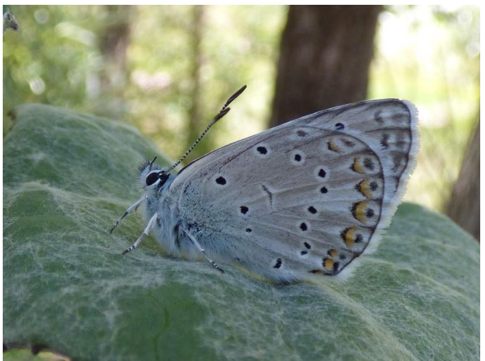
Pic.19. Larger Anatolian Blue ( Polyommatus aedon )