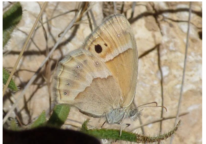
Pic.17. Saadi's Heath ( Coenonympha saadi )