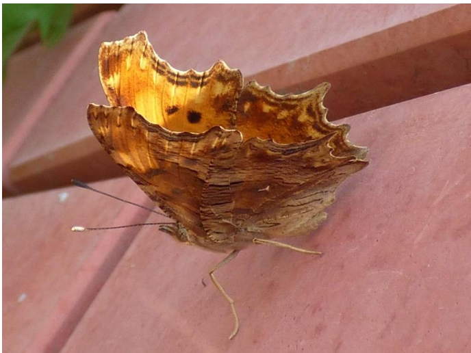
Pic.30. Southern Comma ( Polygonia egea )