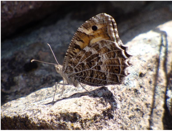
Pic.8. Great Steppe Grayling ( Chazara persephone )