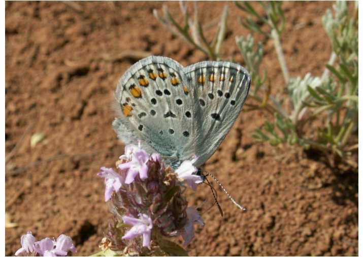
Pic.5. Zephyr Blue ( Plebejus sephirus )