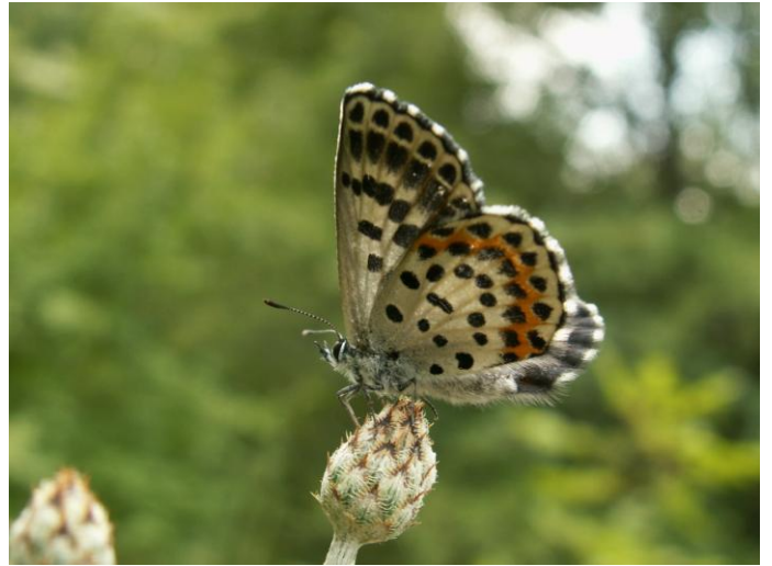
Pic.23. Chequered Blue ( Scolitantides orion )