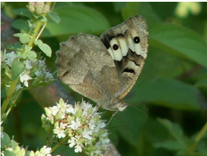
Pic.18. Hermit ( Chazara briseis )