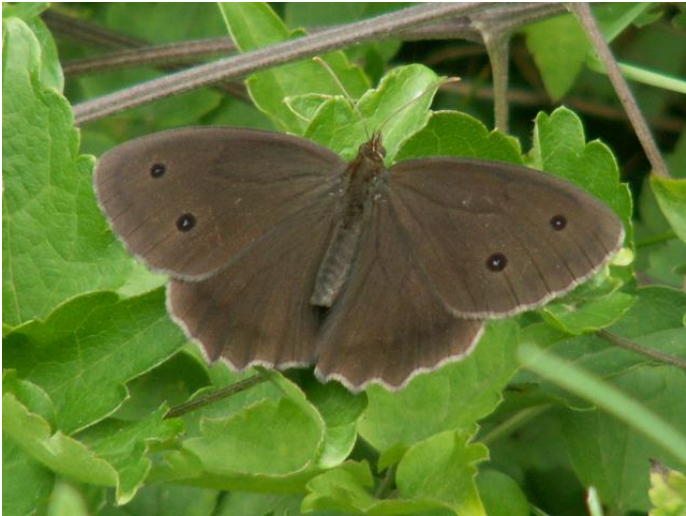
Pic.24. Dryad ( Minois dryas )