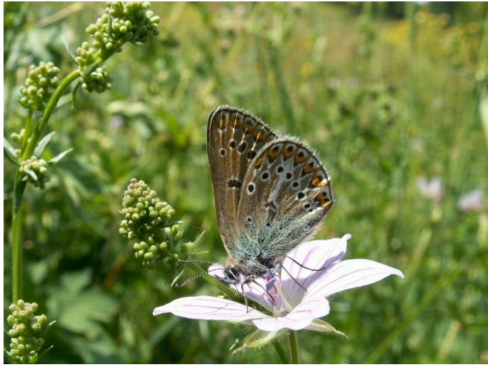
Pic.11. Geranium Argus ( Aricia eumedon )