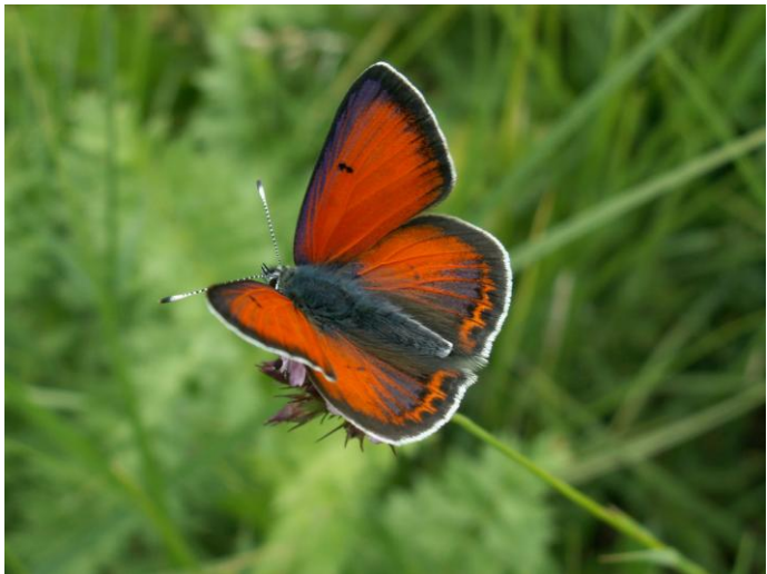
Pic.15. Balkan Copper ( Lycaena candens )