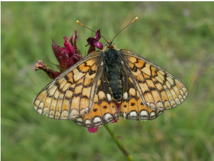
Pic.14. Marsh Fritillary ( Euphydryas aurinia )