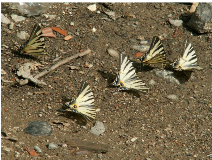
Pic.26. Scarce Swallowtails ( Iphiclides podalirius )