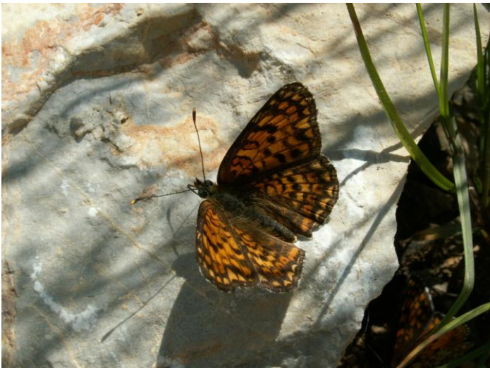
Pic.12. Freyer's Fritillary ( Melitaea arduinna )