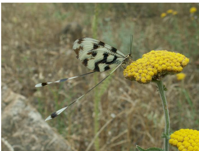
Pic.2. Spoonwing Lacewing ( Nemoptera sinuata )