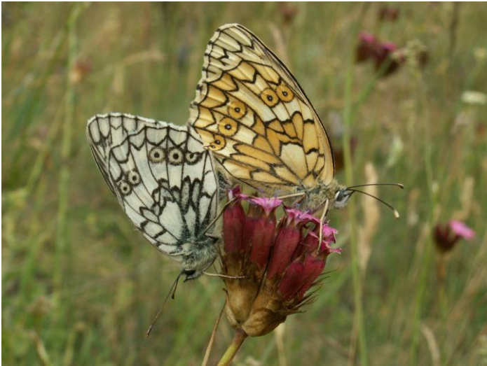
Pic.10. Esper's Marbled White ( Melanargia russiae )