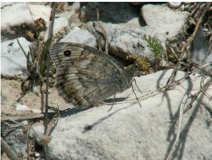
Pic.6. Macedonian Grayling ( Pseudochazara cingovskii )