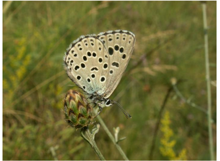
Pic.25. Large Blue ( Phengaris arion )