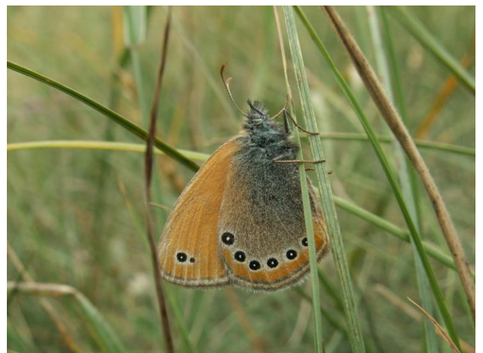
Pic.9. Russian Heath ( Coenonympha leander )