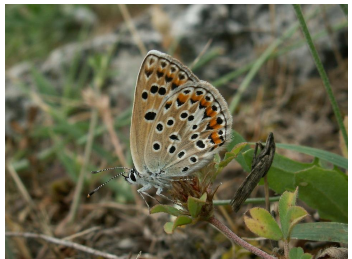
Pic.21. Escher's Blue ( Polyommatus escheri )