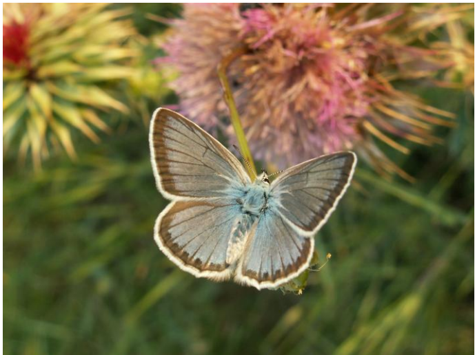
Pic.13. Eros Blue ( Polyommatus eros eroides )