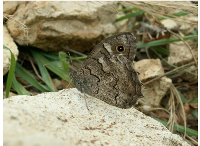
Pic.17. Freyer's Graylings ( Neohipparchia fatua )