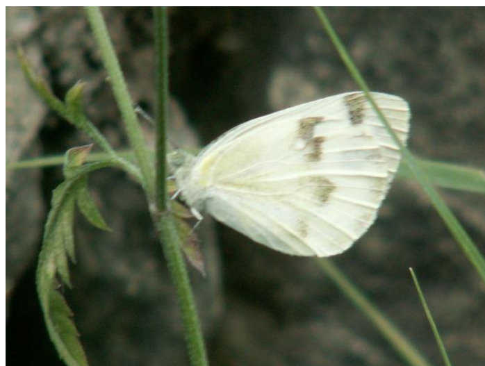
Pic.3. Krueper's Small White ( Pieris krueperi )