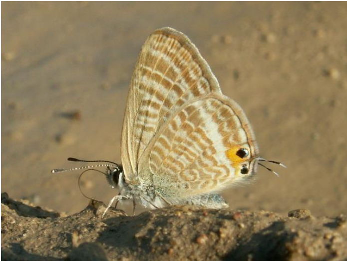
Pic.16. Long-tailed Blue ( Lampides boeticus )