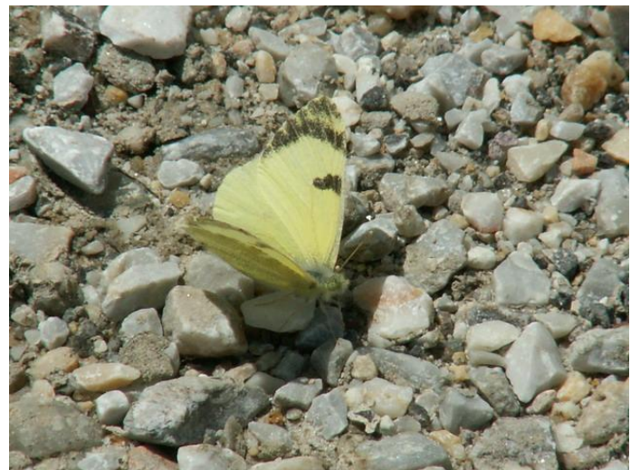
Pic.7. Eastern Greenish Black-tip ( Euchloe penia )