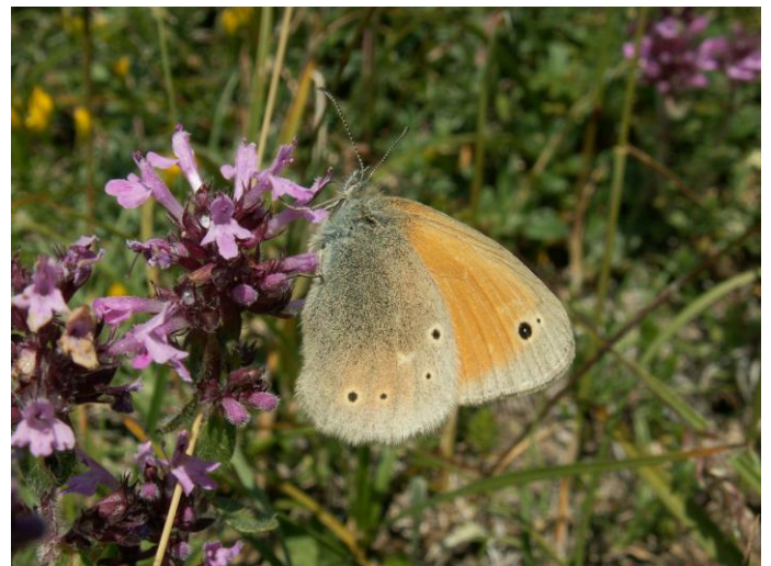
Pic.19. Eastern Large Heath ( Coenonympha rhodopenensis )