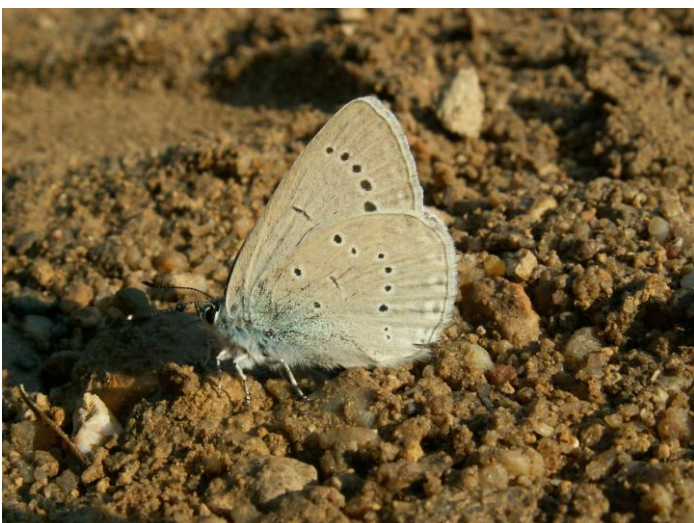
Pic.8. Iolas Blue ( Iolana iolas )