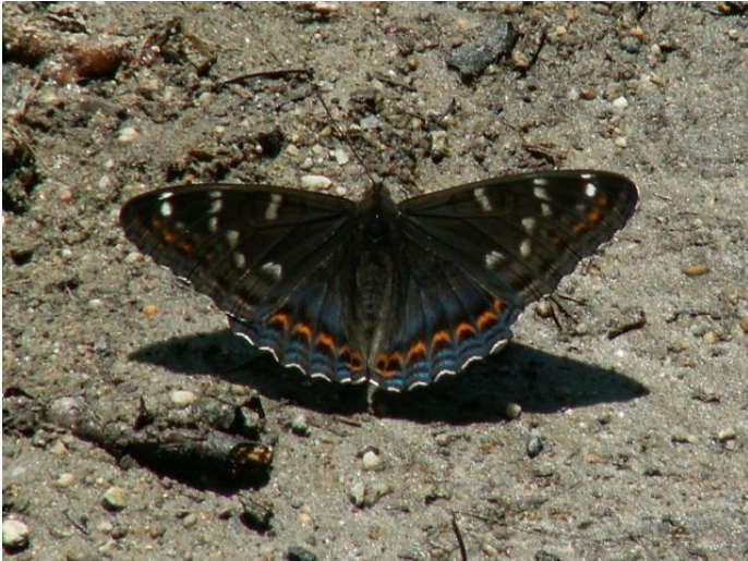
Pic.4. Poplar Admiral ( Limenitis populi )