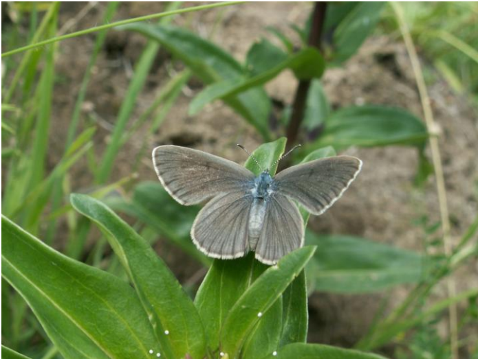
Pic.22. Alcon Blue ( Maculinea alcon rebeli )