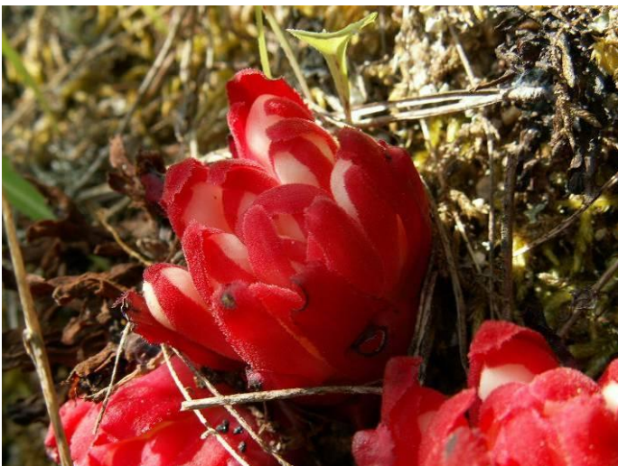
Pic.11. Parasitic plant Cytinus hypocistis