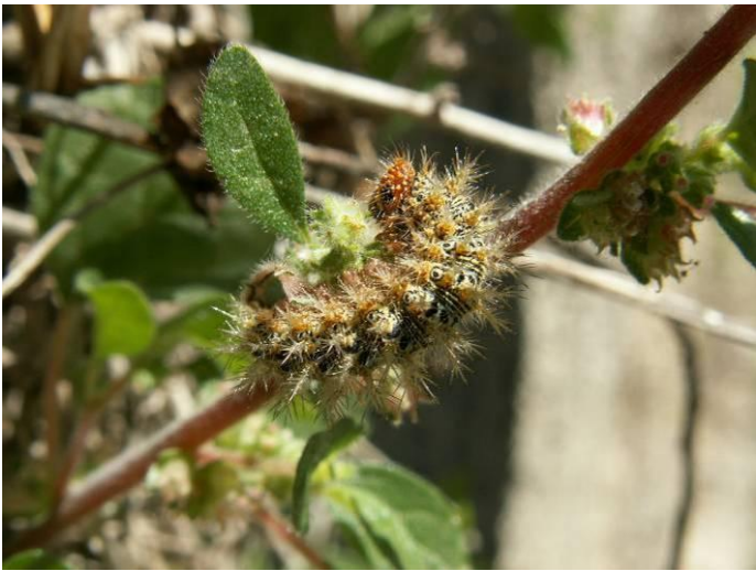
Pic.3. Caterpillar of Southern Comma ( Polygonia egea )