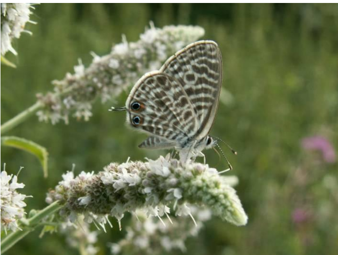
Pic.17. Lang's Short Tailed Blue ( Leptotes pirithous )