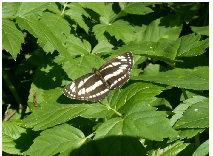
Pic.18. Common Glider ( Neptis sappho )