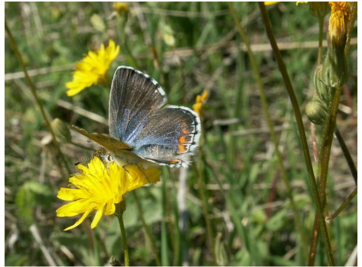
Pic.8. Bavius Blue ( Pseudophilotes bavius )