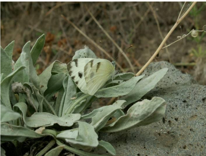
Pic.15. Krueper's Small White ( Pieris krueperi )