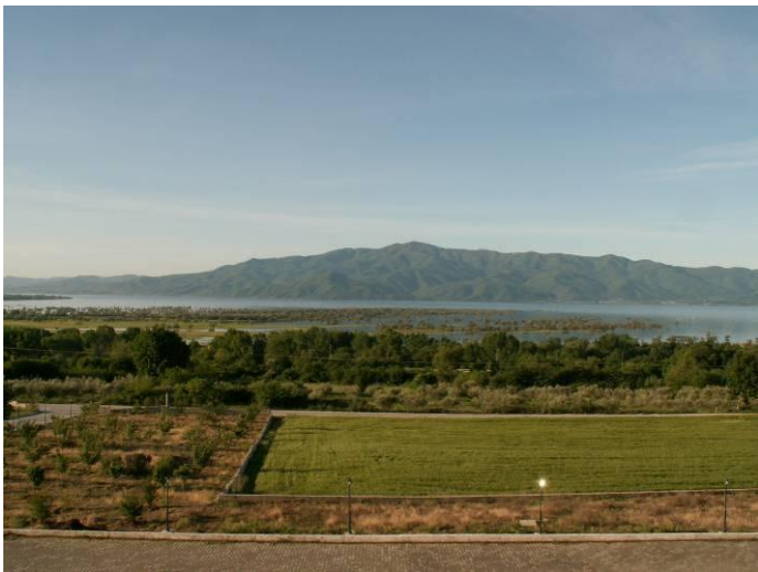
Pic.1. View from the hotel to Kerkini lake