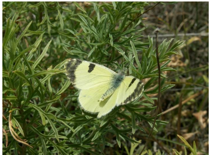
Pic.10. Eastern Greenish Black-tip ( Euchloe penia )