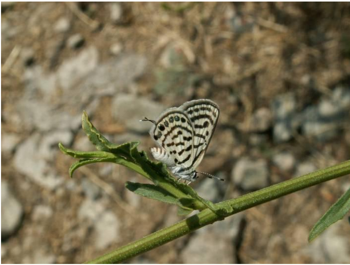
Pic.13. Little Tiger Blue ( Tarucus balkanicus )