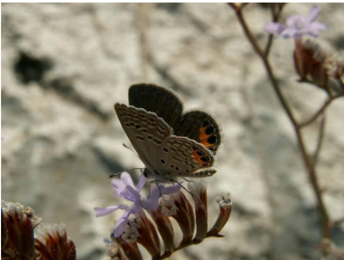
Pic.9. Grass Jewel ( Chilades trochylus )