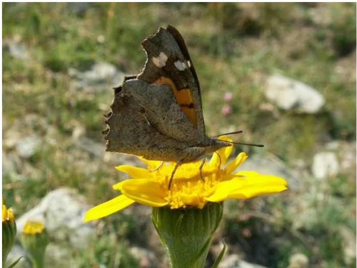
Pic.4. Nettle Tree Butterfly ( Libythea celtis )