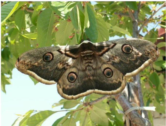
Pic.2. Giant Peacock Moth ( Saturnia pyri )