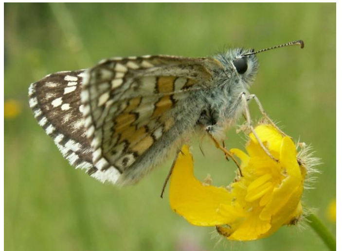
Pic.16. Yellow Banded Skipper ( Pyrgus sidae )