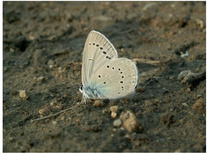
Pic.14. Iolas Blue ( Iolana iolas )