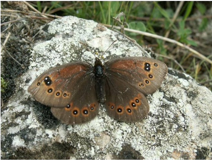
Pic.7. Dalmatian Ringlet ( Proterebia afra )