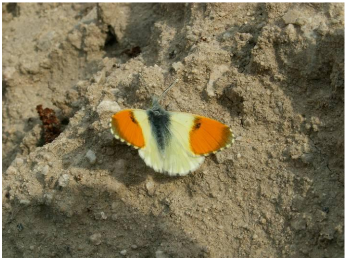
Pic.6. Gruner's Orange Tip ( Anthocharis gruneri )