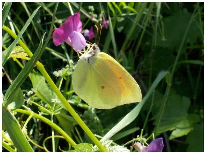
Pic.12. Cleopatra ( Gonepteryx cleopatra )