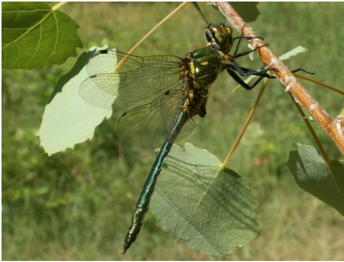
Pic.16. Balkan Emerald ( Somatochlora meridionalis )