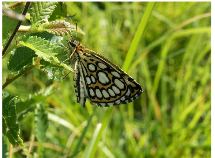
Pic.13. Large Chequered Skipper ( Heteropterus morpheus )