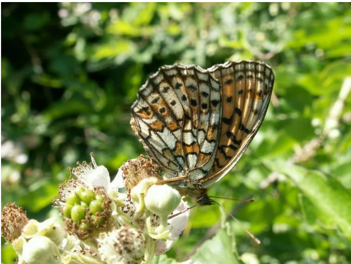
Pic.6. Twin-spot Fritillary ( Brenthis hecate )