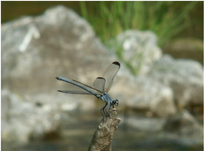
Pic.17. Odalisque ( Epallage fatime )