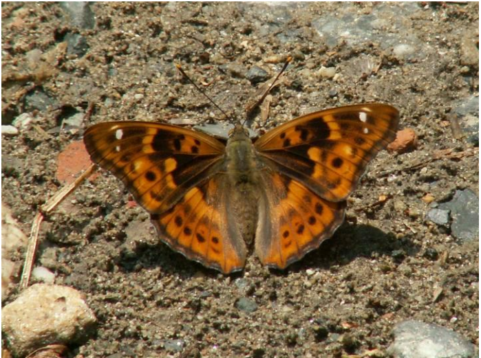
Pic.21. Lesser Purple Emperor ( Apature ilia )