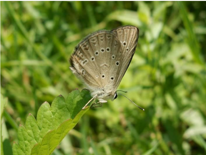
Pic.18. Anomalous Blue ( Agrodiaetus admetus )