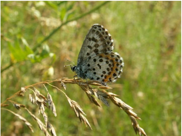
Pic.19. Chequered Blue ( Scolitantides orion )