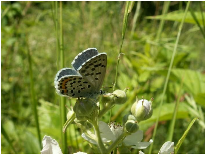
Pic.4. Eastern Baton Blue ( Pseudophilotes vicrama )