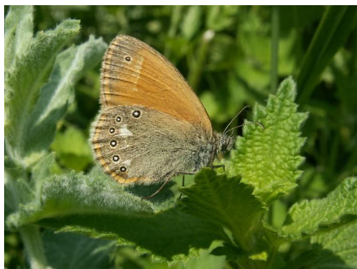
Pic.3. Chestnut Heath ( Coenonympha glycerion )