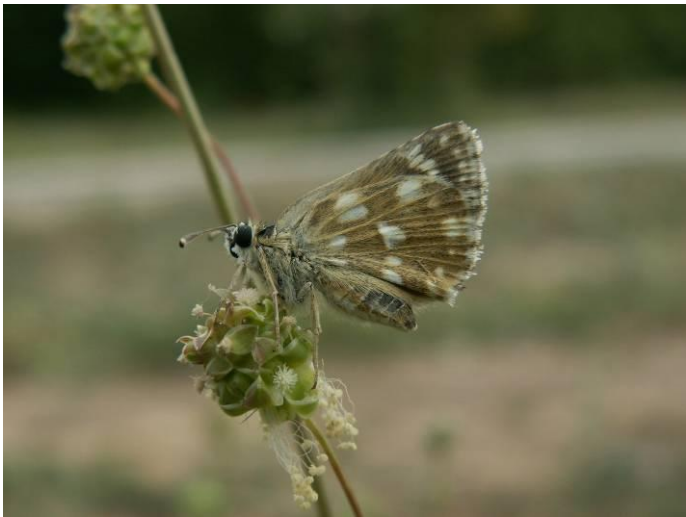
Pic.8. Orbed Red-underwing (Hungarian) Skipper ( Spialia orbifer )