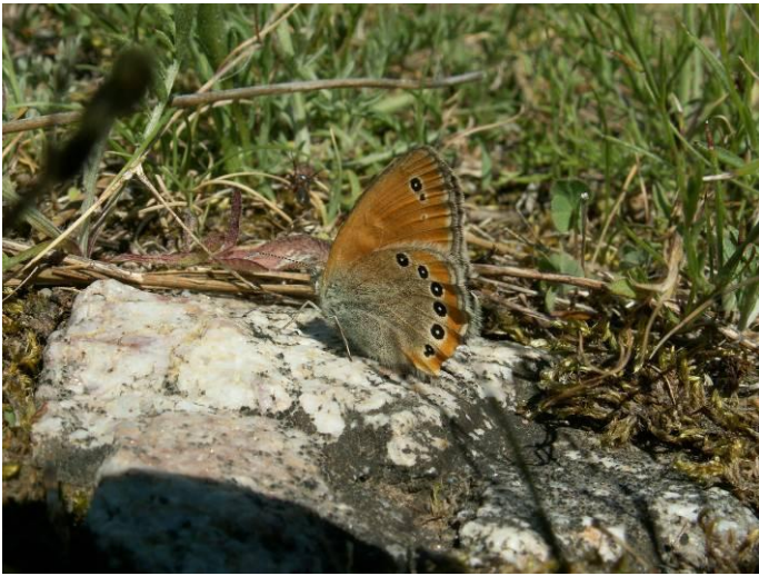
Pic.10. Russian Heath ( Coenonympha leander )