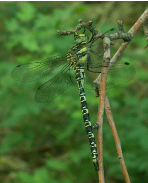
Pic.9. Eastern Spectre ( Caliaeschna microstigma )