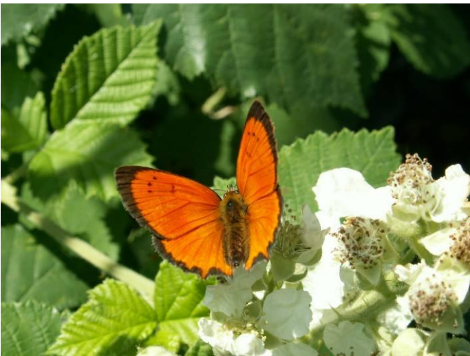
Pic.12. Grecian Copper ( Lycaena ottomana )