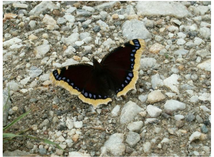
Pic.11. Camberwell Beauty ( Nymphalis antiopa )