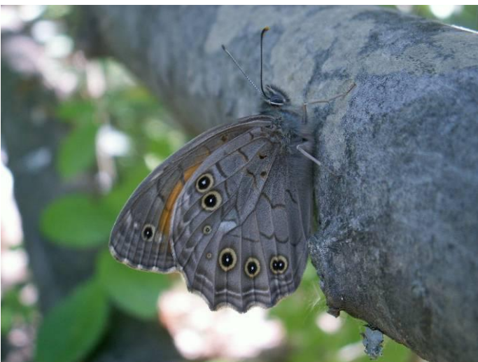
Pic.14. Lattice Brown ( Kirinia roxelana )