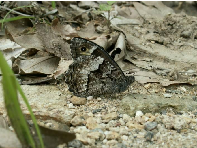
Pic.20. Eastern Rock Grayling ( Hipparchia syriaca )