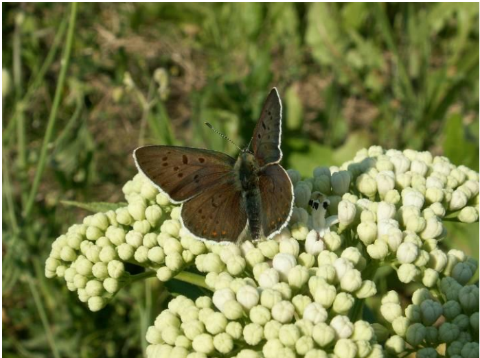
Pic.5. Sooty Copper ( Lycaena tityrus )