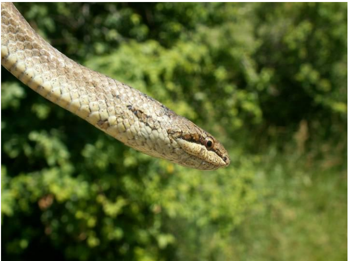
Pic.7. Smooth Snake ( Coronella austriaca )